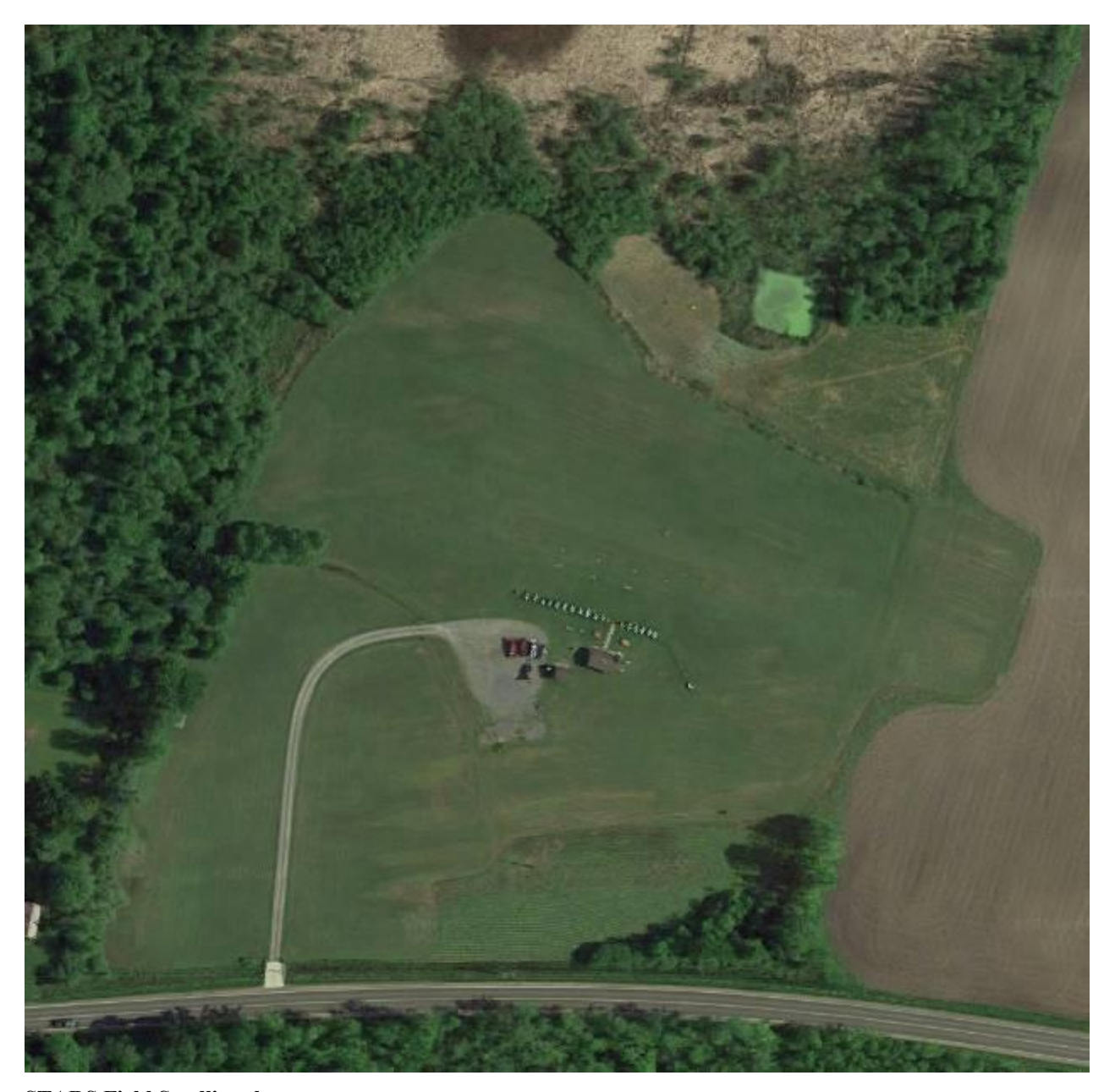
STARS Field Satellite photo